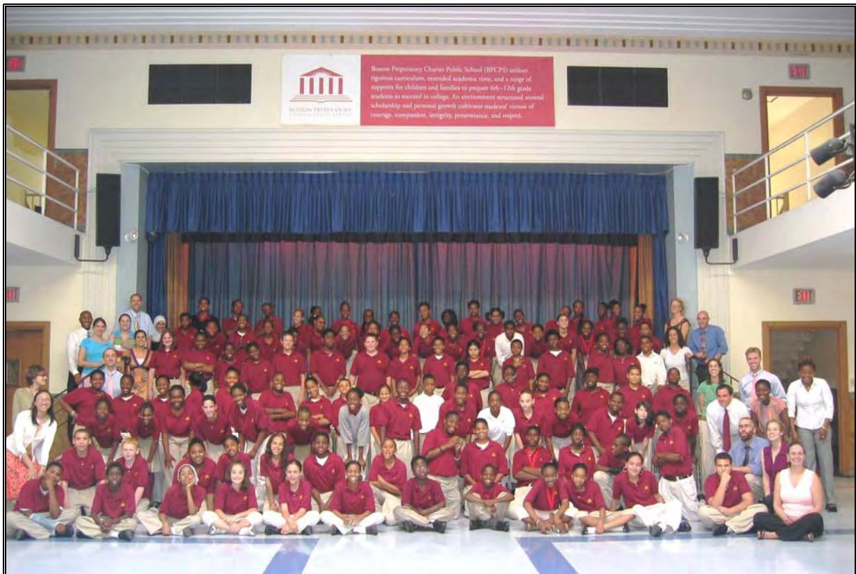
June 30, 2006: Last Day of School

“Boston Preparatory Charter Public School (BPCPS) utilizes rigorous curriculum, extended academic time, and a range of supports for children and families to prepare 6 th -12 th grade students to succeed in college. An environment structured around scholarship and personal growth cultivates students’ virtues of courage, compassion, integrity, perseverance, and respect.”