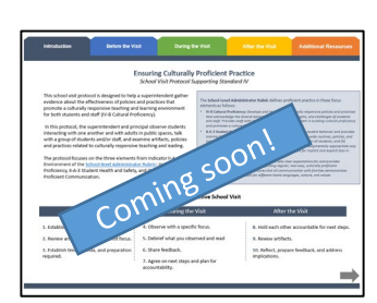
School Visit Protocol #4B: Cultural Responsiveness