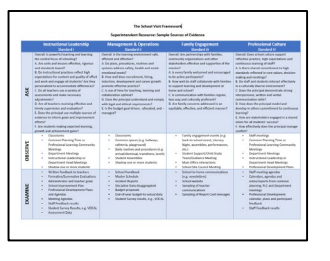
Sample Sources of Evidence