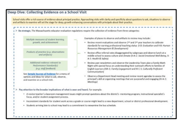
Deep Dive: Collecting Evidence on a School Visit