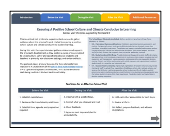
School Visit Protocol #2: School Culture