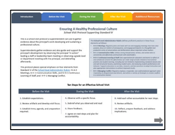
School Visit Protocol #4A: Professional Culture