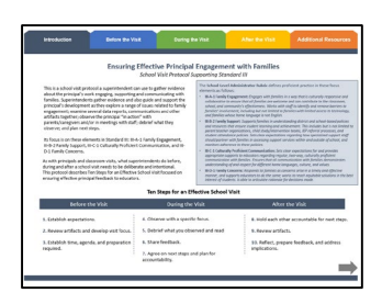
School Visit Protocol #3: Family Engagement