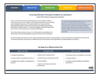
School Visit Protocol #1: Observations and Feedback