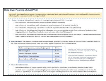
Deep Dive: Planning a School Visit