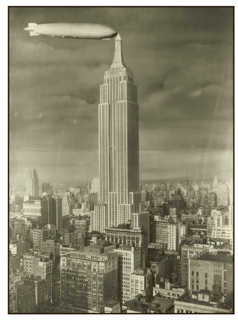
A simulated image of a dirigible docking at the mooring mast

Dirigibles had a top speed of eighty miles per hour, and they could cruise at seventy miles per hour for thousands of miles without needing refueling. Some were as long as one thousand feet, the same length as four blocks in New York City. The one obstacle to their expanded use in New York City was the lack of a suitable landing area. Al Smith saw an opportunity for