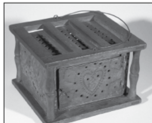
a colonial foot warmer

"Take a piece of wood, fling it out the window into the Yard; then run downstairs as hard as you ever can; when you have got it, run up again with the same measure of speed; keep throwing and fetching up until the Exercise shall sufficiently heated you. Renew as often as the occasion shall require!"