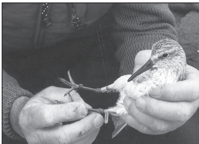
B95, as he appeared in his gray nonbreeding plumage at Rio Grande, November 8, 2007