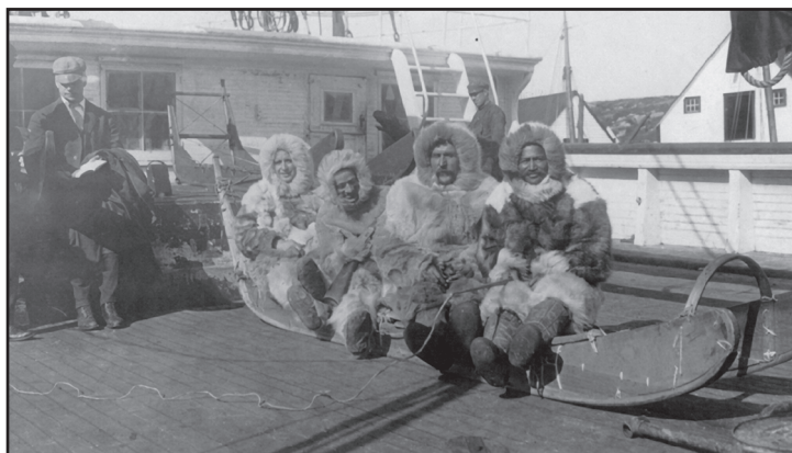
Henson (right) and some of the crew relax on a sledge aboard a ship