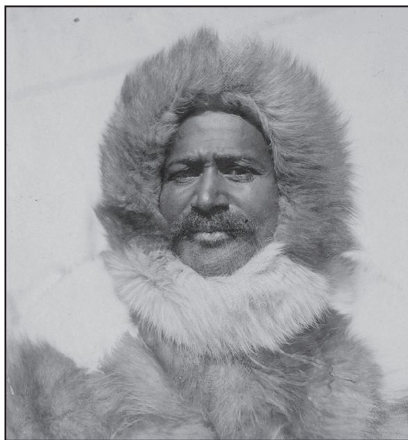
Matthew Henson, dressed for the cold!