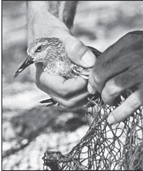
A worker frees a knot from a cannon net.